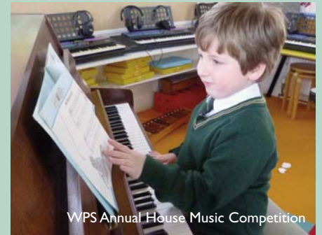
WPS Annual House Music Competition