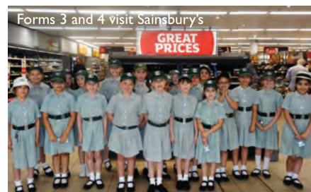
Forms 3 and 4 visit Sainsbury's

As part of the Food Technology unit on 'A healthy and varied diet,' Forms 3 and 4 visited Sainsbury's in Wilmslow. During our visit the children had a tour of the store and were lucky enough to go 'behind the scenes', including taking a seat in the manager's office where they were shown how the store decides what to sell, how and when stock is ordered and replenished, and how the store is organised. The children also had a talk on food hygiene and safety, and learnt about food labelling and food storage.