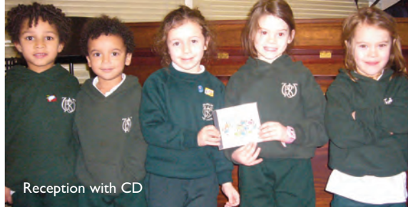
Reception with CD