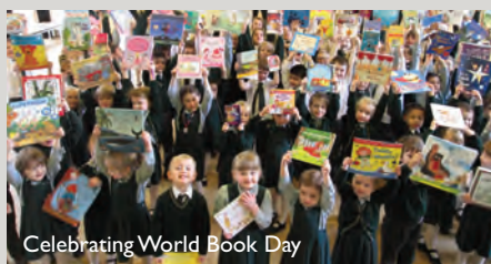
Celebrating World Book Day

This year, we celebrated World Book Day with the WPS Big Read. It was lovely to see the children so enthusiastic about the book they each brought in and we all went away with new favourites.