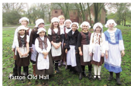
Tatton Old Hall

In December, the children in Form 5 experienced a living history day to support their topic work on the Tudors. The children learned how to wattle and daub, how to make flour and how to spin wool. They also learned about the deer on the Tatton estate. It was a fabulous trip and a great learning experience for everyone.