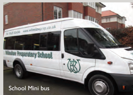
School Mini bus

A huge thank you to the Parents' Committee who raised funds for the School and to all the parents who have attended events, bought raffle tickets and donated items, or supported events in any way.