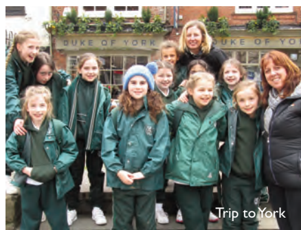
Trip to York